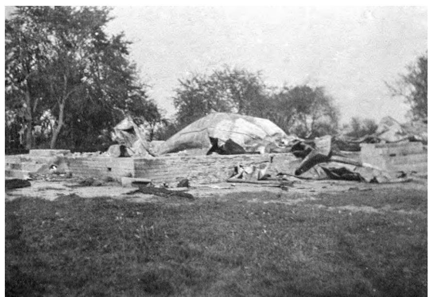
Figure 1: The church following the massacre, 1943.

jumped through the window with me were machined gunned down by the Germans.<sup>16</sup>