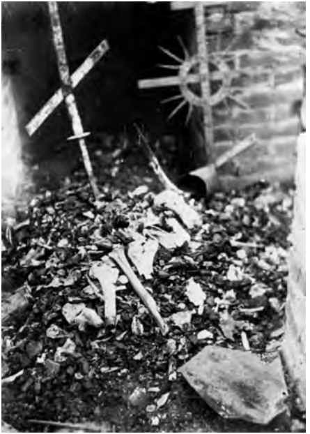
Figure 4: Human remains in the church, 1943.

Contesting the Malyn Massacre: The Legacy of Inter-Ethnic Violence and the Second World War in Eastern Europe