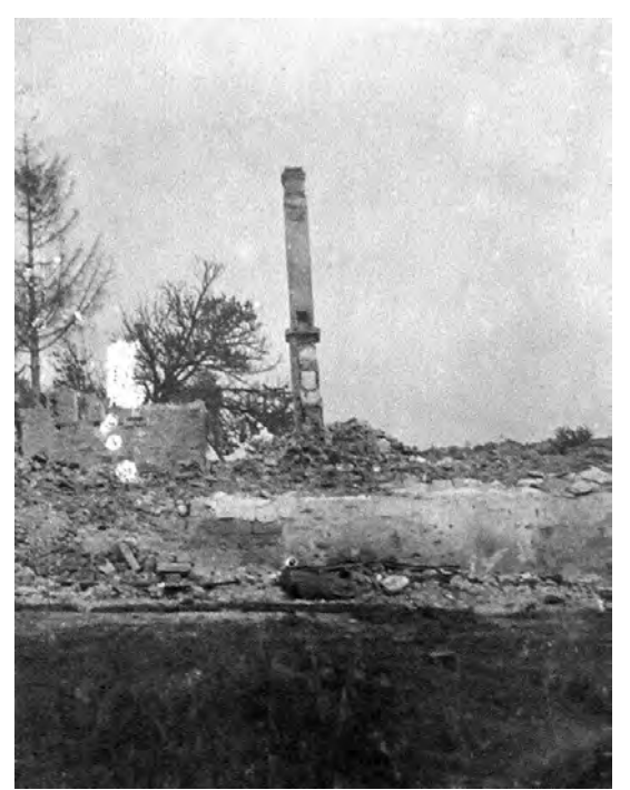
Figure 2: The school following the massacre, 1943.

Meanwhile, the nurse Olga Trikhleb and her patients hid in deathly silence in the hospital cellar: