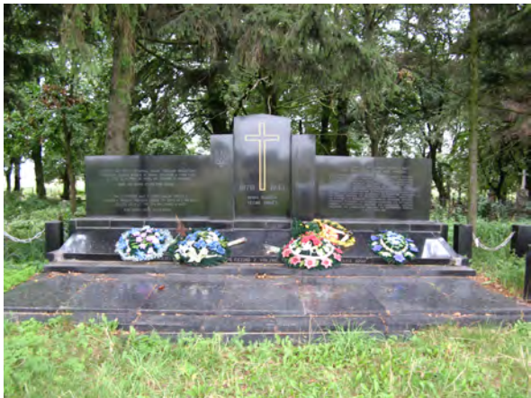
Figure 12: Memorial for Malyn's Czechs in the Czech cemetery, 2013.

with money from abroad, and even a small one-room building marked "klub" in handwritten Ukrainian. But if you look closer at the monuments in this nondescript rural village, you can clearly see the pockmarks of the violence from the twentieth century.