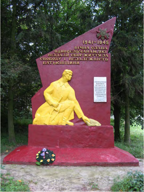
Figure 14: Soviet memorial for Malyn's citizens who fought and died in World War II.

Even if we wanted to counter this trend by building our own, more inclusive museum for Malyn—how would we accomplish this? How many rooms would we need? In what language would we write the exhibits? More importantly, where would the museum be located? In contemporary Malyn, Ukraine? Or in Nový Malín in the Czech Republic? Moreover, how might we narrativize this museum? Would we tell its story using the Czech, Ukrainian, Polish, or Soviet narratives? Could all of the different contributors to Malyn's memory work together to honor the victims in a meaningful way?