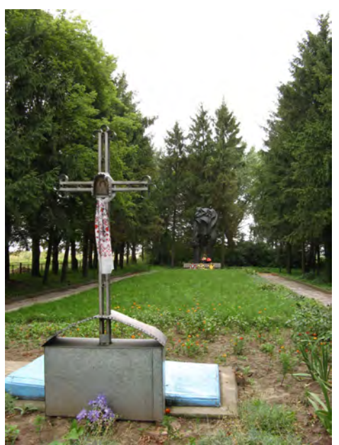
Figure 13: Malyn, 2013: Two memorials where the church previously stood. Author.

Sixty years later, even the memorial landscape in contemporary Malyn mirrors the the discursive landscape surrounding the reprisal. The villagers of Malyn, neighbors, friends, and acquaintances who lived side by side for generations and even died together—have now been separated in place, memory, and commemoration at the expense of propagating a homogenous national memory. Is this how the victims of the massacre would want to be remembered—as victims from separate nations or ethnic groups, rather than citizens of Malyn or Volhynia?<sup>216</sup>