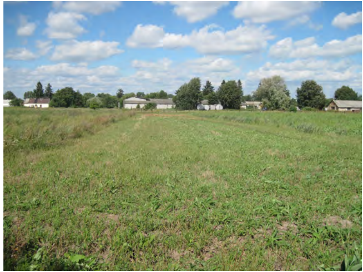
Figure 15: Malyn, 2013: the area where Czech Malyn was located.

I cautiously looked around and saw that there were no more Germans. I bound my leg with my shirt and crawled [away from the school]. I then tried to look for some help. I crawled to a nearby Ukrainian cottage, which fortunately had not been burned down. Once there, I lost consciousness from blood loss and shock. I don't know how long I laid there. The owner of the cottage, who fled when the Germans arrived, eventually came home. In the darkness he came and helped me, giving me further treatment. "Please harness the horse and take me to my sister in Knerut," "I can't—I don't have a horse—the Germans took it." The Ukrainian then carried me on his back to my sister's home. I probably grew heavier over time, since I'm not a small person. He had to stop and rest several times. Despite being shot four times in the calf by a machine gun and not receiving adequate medical care, I healed. However, I walk with a permanent limp.<sup>217</sup>