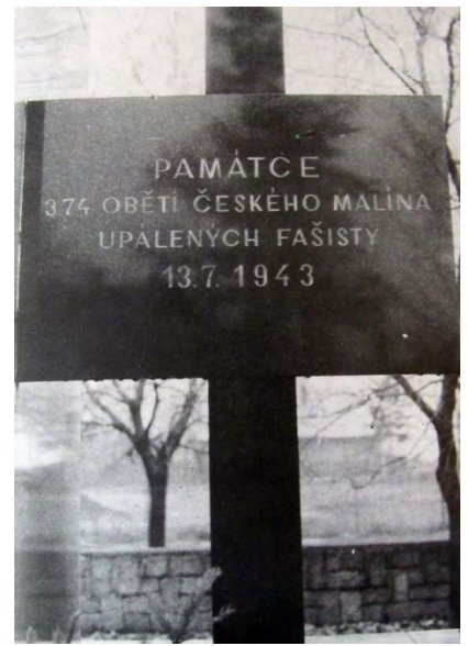
Figure 7: Monument in Nový Malín installed in 1972 on 30th anniversary of the massacre.

Throughout the 1970s and 1980s, Malyn remained a symbol of the joint suffering between the Czech, Ukrainian, and Russian people. Various delegations travelled between Ukraine and Czechoslovakia to commemorate the anniversaries of the massacre. At one such commemoration in 1979, the Czechoslovak delegation visiting Malyn presented the town with gifts from the citizens of Lidice and Nový Malín. An article, entitled "The Eternal Flame of Malyn" in the Rivne regional newspaper, Chervonyi Prapor , describes how "near the graves of our brothers—the victims of fascism and Ukrainian bourgeois nationalism, a meeting took place between Soviet and Czechoslovakian nations."<sup>122</sup> Here we can clearly see how Malyn served as a unifying symbol of druzhba narodov (friendship of nations) for these "brother" nations who suffered both at the hands of Ukrainian nationalists and the German fascists.<sup>123</sup> One is tempted to even rename this druzhba zhertv (friendship of victims), given the way victimhood was used between these Eastern Bloc countries.