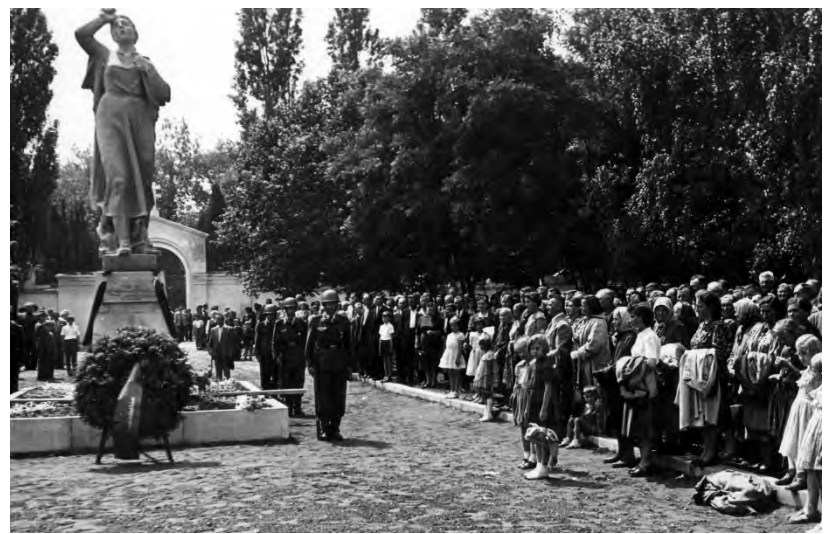
Figure 9: Monument in Zatec, Czechoslovakia, likely 1950s or 1960s.

druzhba narodov with a heavy dose of militarism, celebrating the role of the Soviet Union and, in particular, the 1<sup>st</sup> Czechoslovak Army Corps in vanquishing the Nazis.