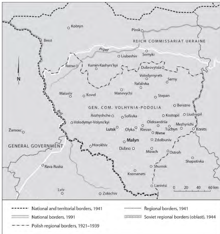
Volhynia under German occupation, 1941-1943