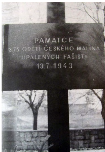
Figure 7: Monument in Nový Malín installed in 1972 on 30th anniversary of the massacre.

Throughout the 1970s and 1980s, Malyn remained a symbol of the joint suffering between the Czech, Ukrainian, and Russian people. Various delegations travelled between Ukraine and Czechoslovakia to commemorate the anniversaries of the massacre. At one such commemoration in 1979, the Czechoslovak delegation visiting Malyn presented the town with gifts from the citizens of Lidice and Nový Malín. An article, entitled “The Eternal Flame of Malyn” in the Rivne regional newspaper, Chervonyi Prapor , describes how “near the graves of our brothers—the victims of fascism and Ukrainian bourgeois nationalism, a meeting took place between Soviet and Czechoslovakian nations.” 122 Here we can clearly see how Malyn served as a unifying symbol of druzhiba narodov (friendship of nations) for these “brother” nations who suffered both at the hands of Ukrainian nationalists and the German fascists. 123 One is tempted to even rename this druzhiba zhertv (friendship of victims), given the way victimhood was used between these Eastern Bloc countries.