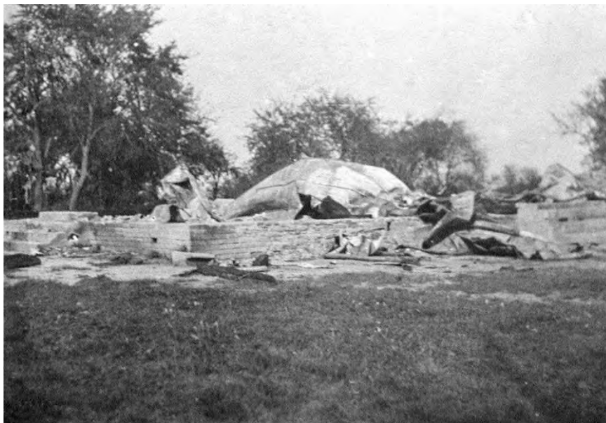
Figure 1: The church following the massacre, 1943.

jumped through the window with me were machined gunned down by the Germans. 16