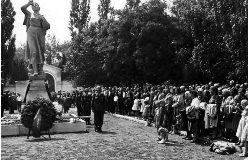
Figure 9: Monument in Zatec, Czechoslovakia, likely 1950s or 1960s.

družba narodov with a heavy dose of militarism, celebrating the role of the Soviet Union and, in particular, the 1 st Czechoslovak Army Corps in vanquishing the Nazis.