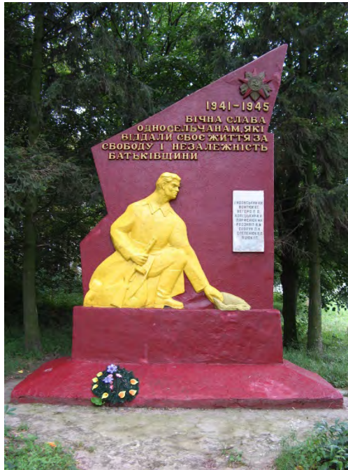
Figure 14: Soviet memorial for Malyn's citizens who fought and died in World War II. Author.

Even if we wanted to counter this trend by building our own, more inclusive museum for Malyn—how would we accomplish this? How many rooms would we need? In what language would we write the exhibits? More importantly, where would the museum be located? In contemporary Malyn, Ukraine? Or in Nový Malín in the Czech Republic? Moreover, how might we narrativize this museum? Would we tell its story using the Czech, Ukrainian, Polish, or Soviet narratives? Could all of the different contributors to Malyn's memory work together to honor the victims in a meaningful way?