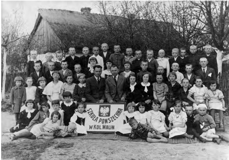
Figure 6: Class photograph from interwar Poland, likely 1936.