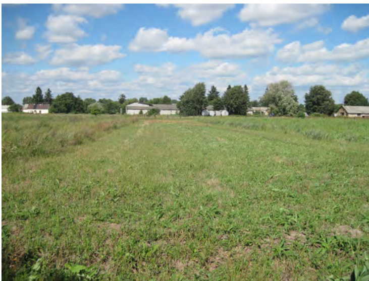
Figure 15: Malyn, 2013: the area where Czech Malyn was located.

I cautiously looked around and saw that there were no more Germans. I bound my leg with my shirt and crawled [away from the school]. I then tried to look for some help. I crawled to a nearby Ukrainian cottage, which fortunately had not been burned down. Once there, I lost consciousness from blood loss and shock. I don't know how long I laid there. The owner of the cottage, who fled when the Germans arrived, eventually came home. In the darkness he came and helped me, giving me further treatment. "Please harness the horse and take me to my sister in Knerut," "I can't—I don't have a horse—the Germans took it." The Ukrainian then carried me on his back to my sister's home. I probably grew heavier over time, since I'm not a small person. He had to stop and rest several times. Despite being shot four times in the calf by a machine gun and not receiving adequate medical care, I healed. However, I walk with a permanent limp. 217