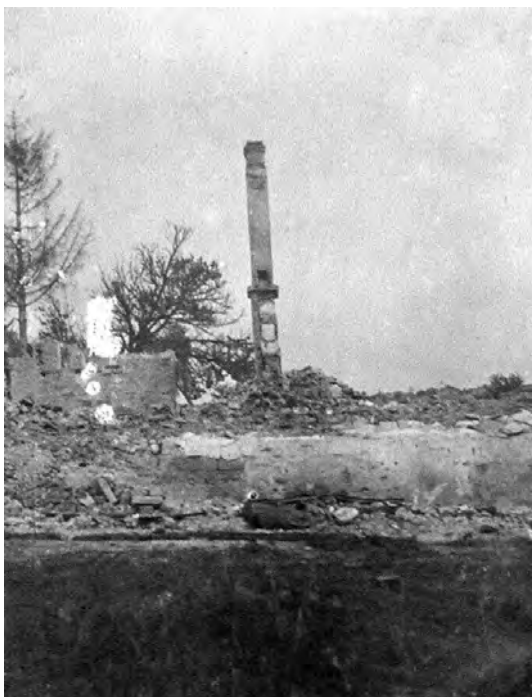
Figure 2: The school following the massacre, 1943.

Meanwhile, the nurse Olga Trikhleb and her patients hid in deathly silence in the hospital cellar: