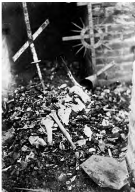
Figure 4: Human remains in the church, 1943.

Ludmila, who survived the massacre hiding in the gardens, effectively captured the immense sense of loss of both Czechs and Ukrainians: “My mother, father, and two older married sisters with their children, were all burned to death. I am now left completely alone, without my family and my kin.” 27