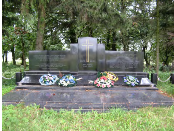
Figure 12: Memorial for Malyn’s Czechs in the Czech cemetery, 2013.

with money from abroad, and even a small one-room building marked “klub” in handwritten Ukrainian. But if you look closer at the monuments in this nondescript rural village, you can clearly see the pockmarks of the violence from the twentieth century.