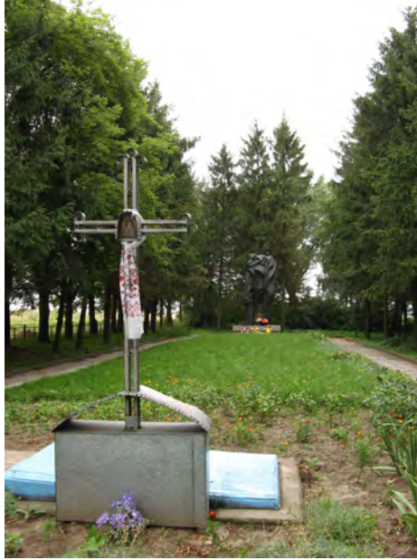
Figure 13: Malyn, 2013: Two memorials where the church previously stood. Author.

Sixty years later, even the memorial landscape in contemporary Malyn mirrors the discursive landscape surrounding the reprisal. The villagers of Malyn, neighbors, friends, and acquaintances who lived side by side for generations and even died together—have now been separated in place, memory, and commemoration at the expense of propagating a homogenous national memory. Is this how the victims of the massacre would want to be remembered—as victims from separate nations or ethnic groups, rather than citizens of Malyn or Volhynia? 216